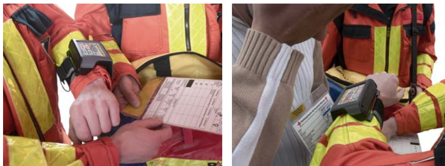
(a) Implementation on the Zypad

The central element of RFID_{double} – the first alternative – is the dual scanning of the RFID-chip. In order to start the triage process the RFID enhanced patient tag has to be scanned with the mobile device. In the mobile user-interface all on the RFID-chip available information can be accessed. The dialog facilitates the selection of the triage category, whereas the pre-defined triage category is already pre-selected. This pre-definition of the RFID-chip is similar to the pre-definition of the paper based colored bar. In the case that the pre-defined triage category conforms to the actual triage category the information is confirmed by a second scan of the RFID-chip. The triage dialog is automatically stored and closed by the second scan. In the rare case that the triage category has to be changed, the user can set the right category by interaction with the touch-screen of the mobile handheld device. Consequently the triage with RFID_{double} consists of four steps: (1) hold the patient tag in front of the mobile device, (2) check the triage category on the display of the mobile device, (3) change category if necessary and (4) hold the patient tag in front of the mobile device a second time.